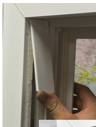
6. Snap in sash stop to conceal the access for both balances. (Included with new balance)