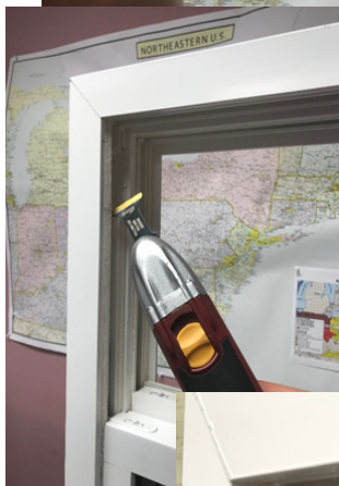
2. Use multi tool or utility knife to remove old balance.