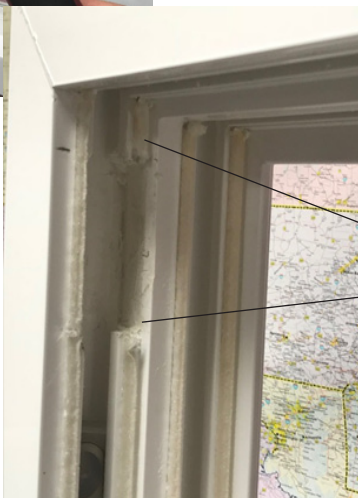
3. Start top of notch cut out 1/2" from top. Make 2nd cut 2 1/2" below