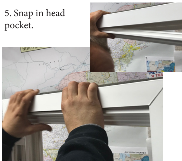
5. Snap in head pocket.