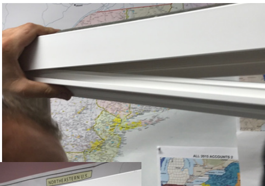
1. Head Sash pocket removal