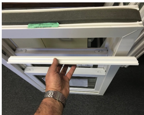
4. With new balance installed replace head pocket