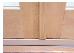
Bottom inside view of factory installed astragal