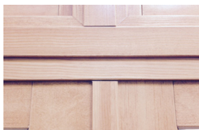
Top inside view of factory installed astragal

An astragal is factory applied to 3 and 4 panel doors. It is manufactured to fit the door and should not be removed or modified in any way . The astragal is the best guide for proper fitting in the frame.