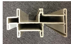
4202, 6400: 3-lite applied in the field