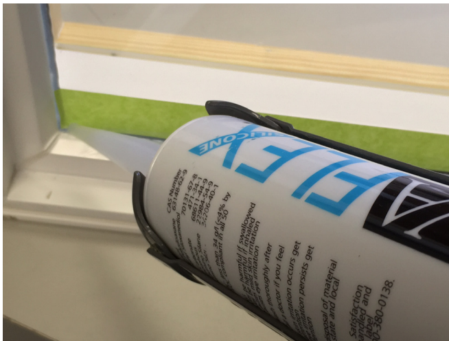
C. The complete perimeter must be sealed.