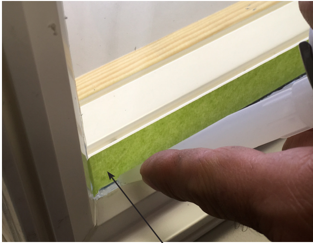
A. On the exterior of the window, apply painters tape to the glass surface exposing the void between the glass and the glazing bed.